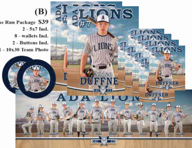
(B) Home Run Package $39 2 - 5x7 Ind. 8 - wallets Ind. 2 - Buttons Ind. 1 - 10x30 Team Photo