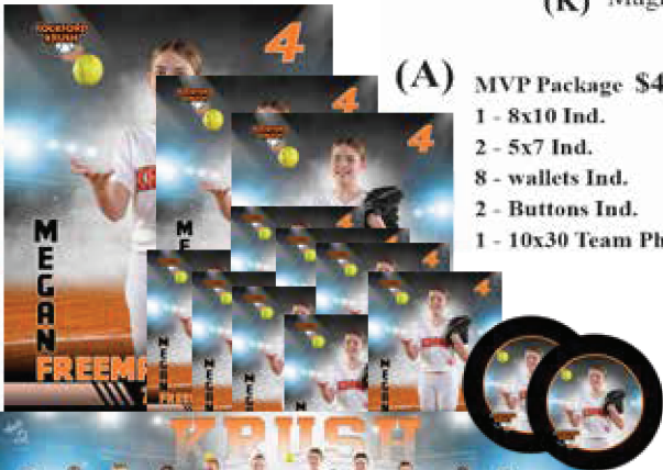
(A) MVP Package $44 1 - 8x10 Ind. 2 - 5x7 Ind. 8 - wallets Ind. 2 - Buttons Ind. 1 - 10x30 Team Photo