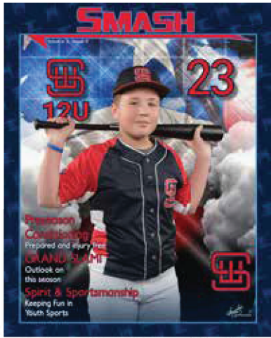
Magazine Cover (8x10) (G)

7620 Myers Lake Ave. Rockford, MI 49341 616) 874-9101