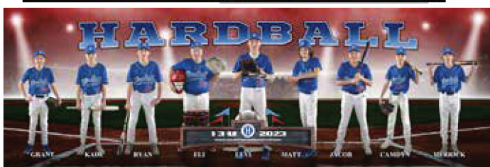
(J) 10" x 30" Team

All Events Photography 7620 Myers Lake Ave. Rockford, MI 49341 (616) 874-9101