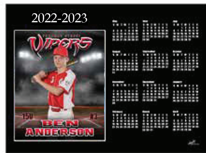
(H) Calendar (10x8)