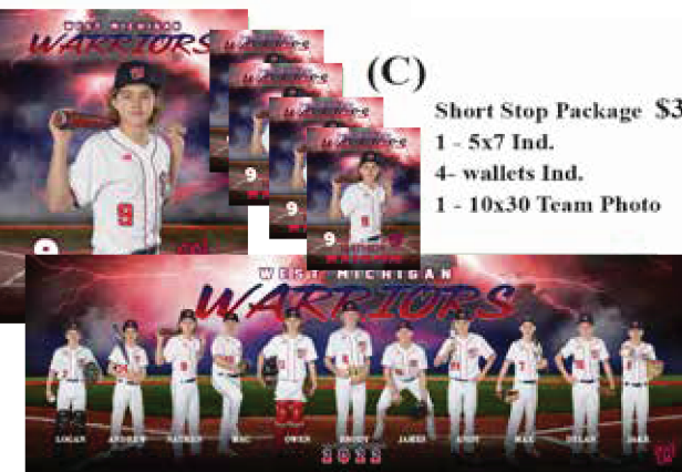
(C) Short Stop Package $37 1 - 5x7 Ind. 4 - wallets Ind. 1 - 10x30 Team Photo