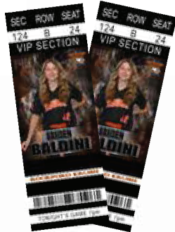
2 "Game Day Tickets" (K) Magnets