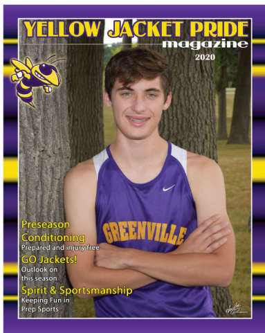
Magazine Cover (8x10) (L)