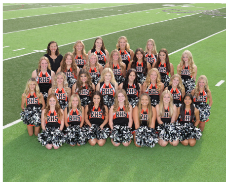
Regular Team Photo (T & U)

All Events Photography 7620 Myers Lake Ave. Rockford, MI 49341 (616) 874-9101