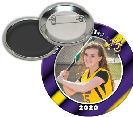
3" Photo Buttons or Photo Magnets (J) (R)