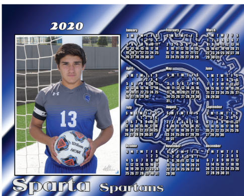
Calendar (10x8) (M)