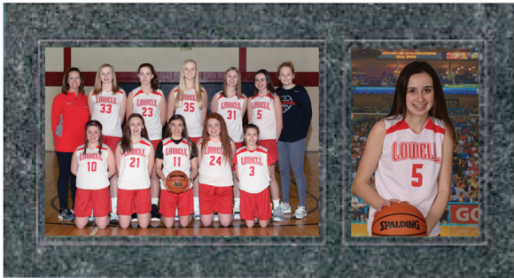
(D) Traditional Memory Mate w/Folder (includes 4x5 individual and 7x5 team photo)

7620 Myers Lake Ave. Rockford, MI 49341 (616) 874-9101