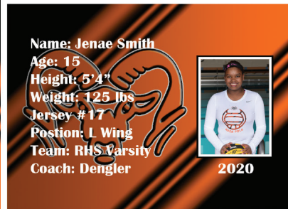
Trader Cards (K)