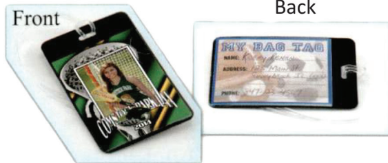
(S) Bag Tag