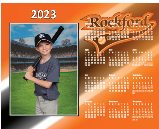
(M) Custom Border Calendar (10x8)