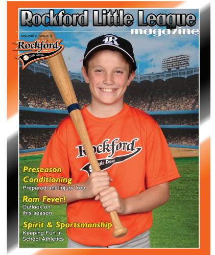
(L) Custom Magazine Cover (8x10)