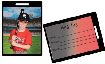
(S) Bag Tags