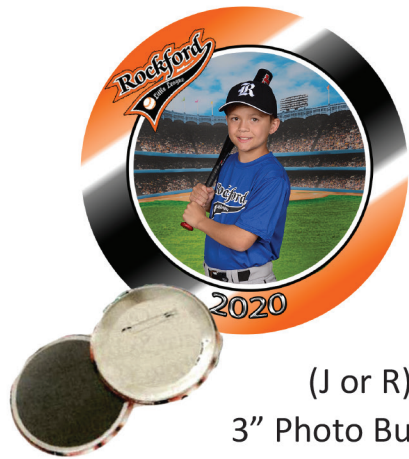
(J or R) 3" Photo Buttons or Magnets