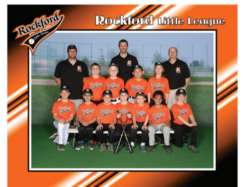
Custom Border Team Photo (N or O)

All Events Douglas Photography 7620 Myers Lake Ave. Rockford, MI 49341 (616) 874-9101