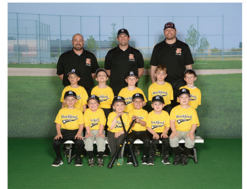
Regular Team Photo (T or U)